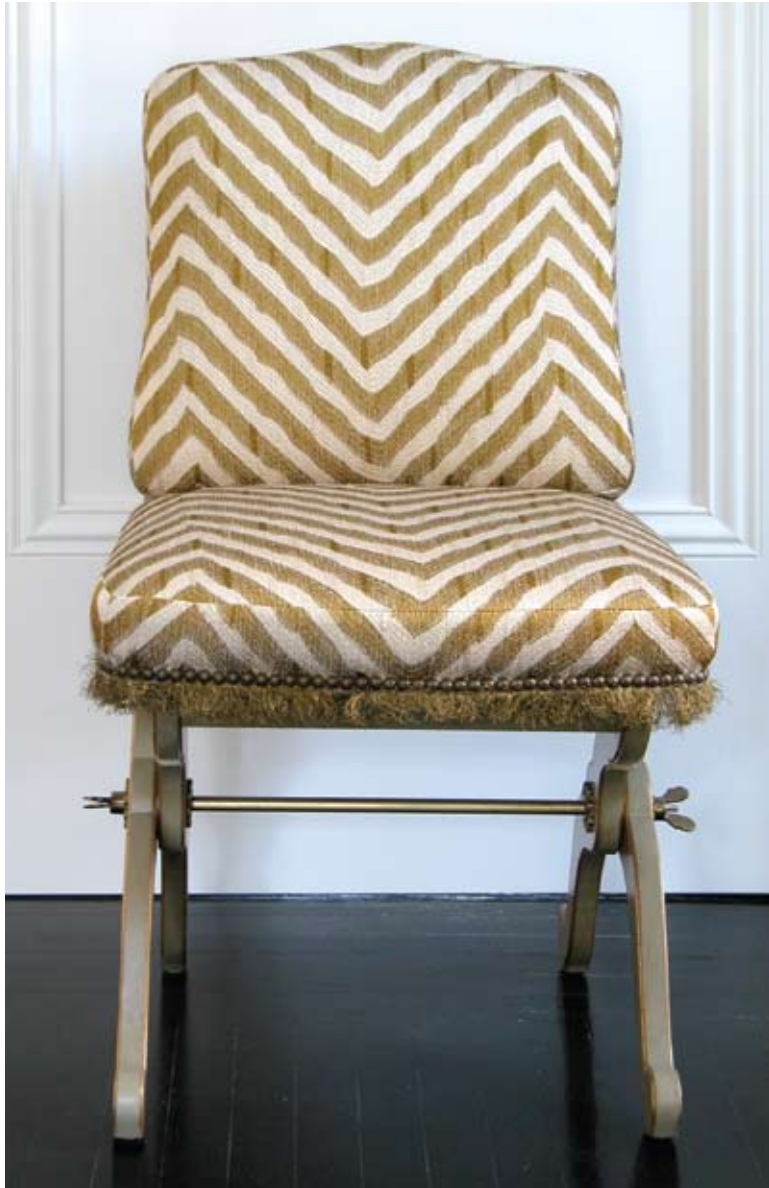
CH 124 Folding Chair